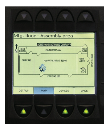
With clear graphics and intuitive prompts, the FireFinder XLS system interface delivers maximum ease of use.

Siemens Industry factory-authorized distributors can provide complete after installation support and services for your entire life safety system. Their factory-trained, certified technicians are backed by more than 60 years of proven innovation in designing and maintaining life safety systems. This means they are able to provide service for all of your life safety needs.